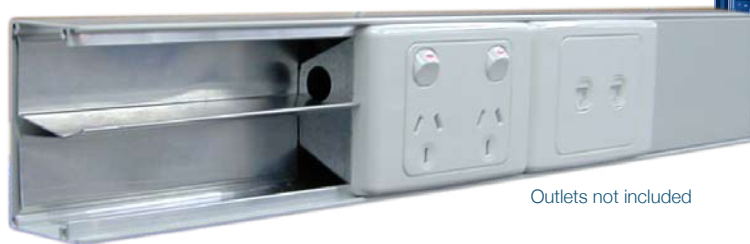
Plastic (Clip-In) Divider

Manufactured in Australia by ESCO Industries