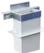
T-Bar Ceiling Mount Kit at the top end makes securing a pole to a T-Bar ceiling with a Flush Flange surround supplied as standard