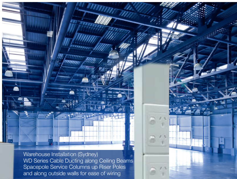
Warehouse Installation (Sydney) WD Series Cable Ducting along Ceiling Beams Spacepole Service Columns up Riser Poles and along outside walls for ease of wiring