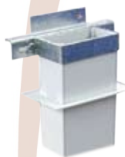
T-Bar Kit Ceiling Mount

Easy ability to be mounted (Back to Back) or along a bench (End to End) plus accessories that make mounting and installation as simple as possible ESCO Spacepole is the ideal solution in any application