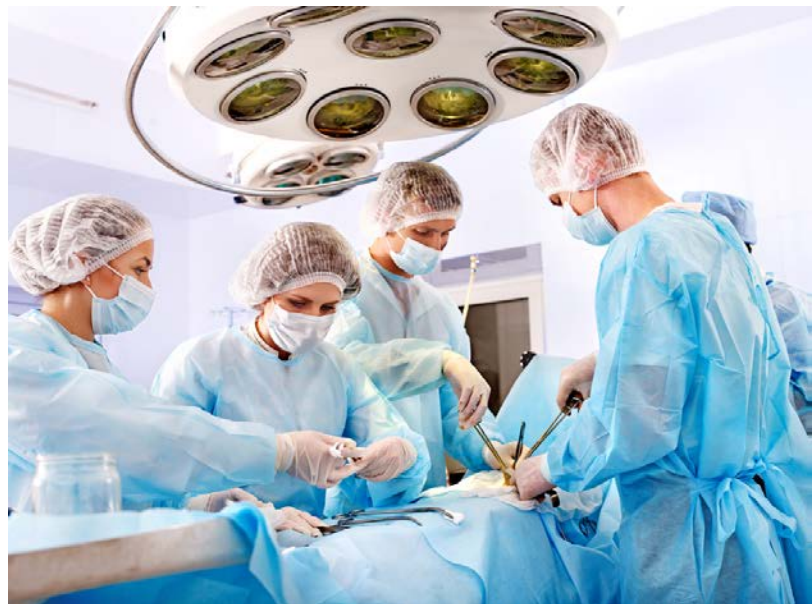
Operating Theatre Environments requiring vital protection and early indication